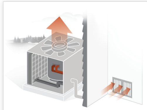
COOLING Heat is transferred from indoor air to the outside.

Air-Source Heat Pump owners are able to flip between heating and cooling from the thermostat.